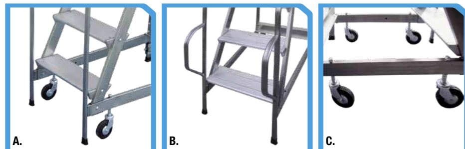
A. CCBR/A Version B. CCBR/MA Version C. CCBR/AA Version

To optimize transport the ladder can be supplied disassembled